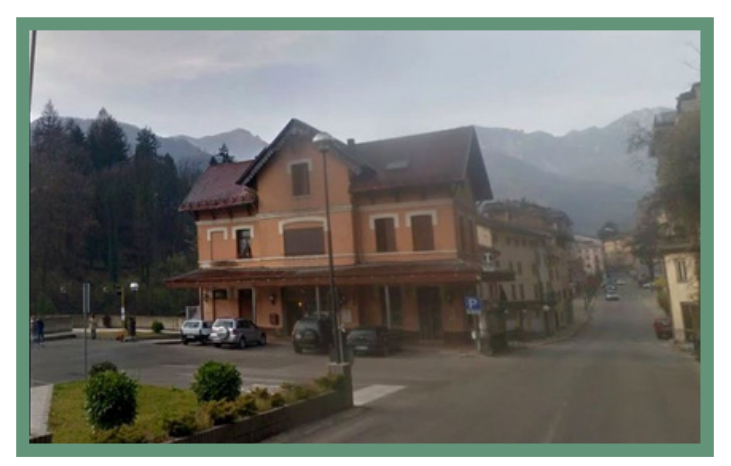
Recoaro Bus Station