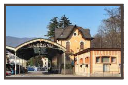
Valdagno Bus Station

Once you are already on board, after 1hour you should be in Valdagno , that means that you are getting closer to Recoaro (15min no much more) , so keep your eyes open.